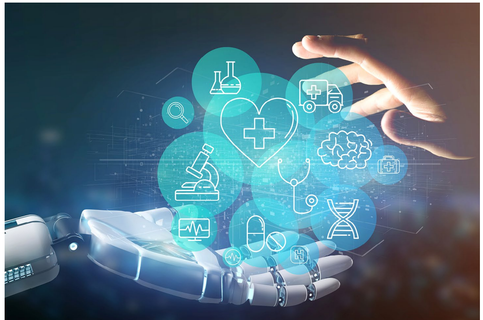
Artificial intelligence can help identify interconnections between data that assist people when making decisions.

People's notions of artificial intelligence (AI) rank between fascination for the technology and fear of losing control. Even though a universally valid definition is still being sought, AI systems are already being used in many industries. Their application raises various questions. One important issue is the safety of the systems.