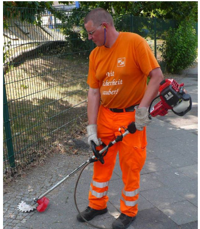
Use of a special brush cutter to remove unchecked growth

Vibration measurements were conducted to EN ISO 5349 under realistic field conditions on four brush cutters fitted with a special mowing head which prevented mowed debris and stones from being kicked up dangerously.